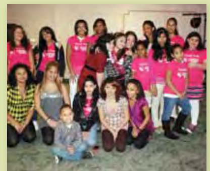
LULAC Boston youth organize an event for Census 2010. Fill out your Census 2010 forms and get them in by April 1st