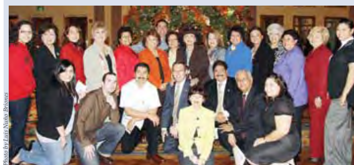
LULAC National Board of Directors and staff in Los Angeles at the LULAC National Veterans Summit.

One-year subscription price is $24. Single copies are $4.50. LULAC members receive a complimentary subscription. The publication encourages LULAC members to submit articles and photos for inclusion in future issues. Once submitted, articles are property of the LULAC News and may be subject to editing.