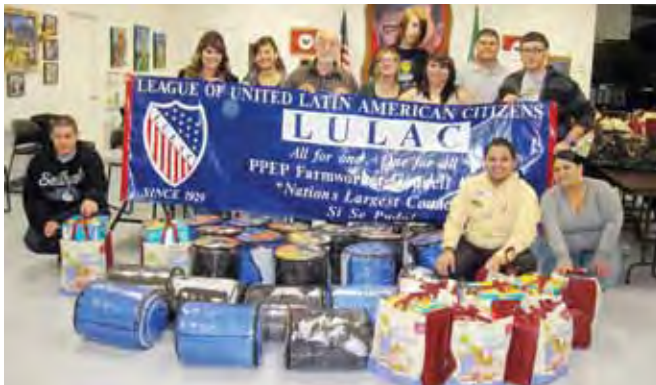
Press conference in Tucson on Haiti relief by LULAC Adelante and PPEP TEC Charter High School students. The LULAC donation bought the Haiti people sleeping bags, bottled water and diapers etc