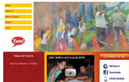
LULAC Youth Website Sponsored by Yum!

Please visit the LULAC Youth web site at www.lulac.org/youth.html .