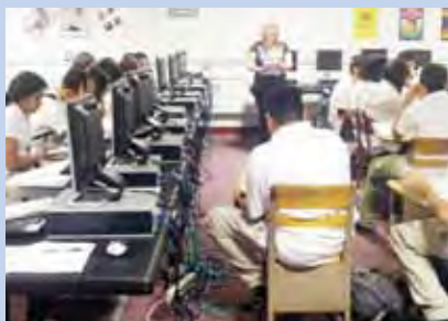
LULAC council in Houston hosts Smart Edge session.

In 2010, LULAC and GMAC will continue expanding their partnership to provide the Latino community with financial literacy skills. The program focuses on budgeting, credit, mortgages, banking, and automotive loans. The LULAC National Office and GMAC will continue training local members to conduct seminars in their respective cities. In 2008 and 2009 LULAC Councils conducted more than 200 sessions in more than 10 states helping more than 7,000 community members receive the training. Local councils received a small stipend for their support of this initiative.