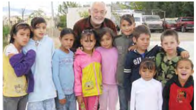
Outreach Mexican Orphanage for abandoned deported children