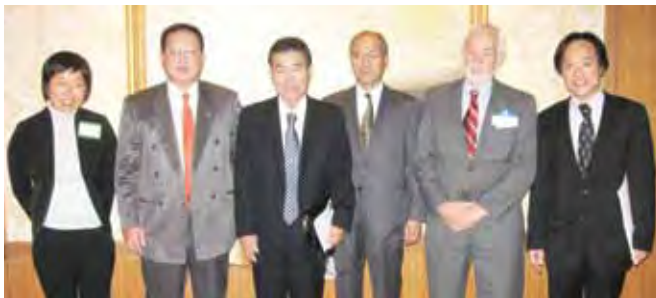
Japanese Rotary Collaboration with Micro Credit program with LULAC Associates Nigeria, Africa

In Nagoya, Japan, in December a presentation was made to the Nagoya Rotary International Club regarding the micro credit efforts of LULAC associates in Owerri, Nigeria. They will jointly apply to Rotary Foundation to capitalize the loan funds in Nigeria so it can become a micro credit bank.