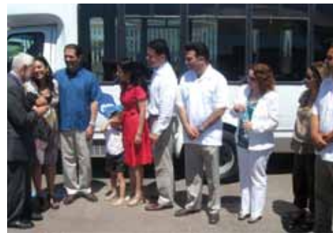
Governor and First Lady of Sonora, Mexico, become LULAC Associates.