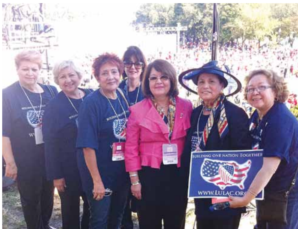
LULAC National Board members with LULAC National President at the One Nation March in Washington, D.C.

and human rights protections to all, ending racial profiling, curbing re-segregation attempts, completing the promise of health care reform with a public option, and ensuring that all people have access to affordable, high quality public education from pre-school through college.