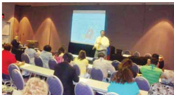
Ally Financial Workshop at National Convention in Albuquerque, N.M.