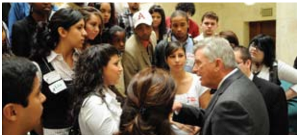
Arkansas Gov. Mike Beebe speaking about the state's DREAM Act before a coalition by the Razorback Young Adult Chapter #761 from the University of Arkansas, Fayetteville.

Some 90,000 students in Arizona, New Mexico, Texas, California and Mexico have participated in LULAC Youth Leadership conferences since 1998. Combating the high dropout rate among Latino high school students is a major goal of LULAC.