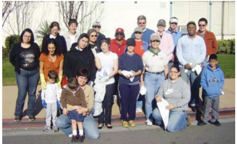
LULAC volunteers in San Jose, Calif.