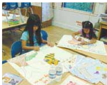
Young Readers students from Los Angeles, CA.

FL; Tampa, FL; Boston, MA; Albuquerque, NM; Cincinnati, OH; Philadelphia, PA; Arlington, VA; Corpus Christi, TX; Dallas, TX; El Paso, TX; and Plano, TX.