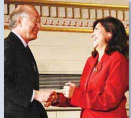
Interior Sec. Salazar and Labor Sec. Solis.

Latinos are playing a significant role in President Barack Obama's new administration, including heads of two Cabinet departments.