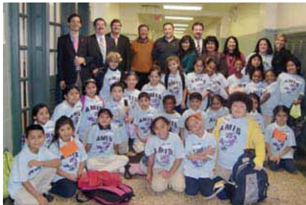
LULAC Ohio state leadership and representatives from LULAC National Educational Service Centers (LNESC) and Procter & Gamble, with students and teachers from the Young Readers program at Academy of Multilingual Immersion Studies (AMIS) in Cincinnati, OH.

LNESC currently operates Young Readers programs at the following locations: Phoenix, AZ; Tucson, AZ; Pomona, CA; Los Angeles, CA; Miami,