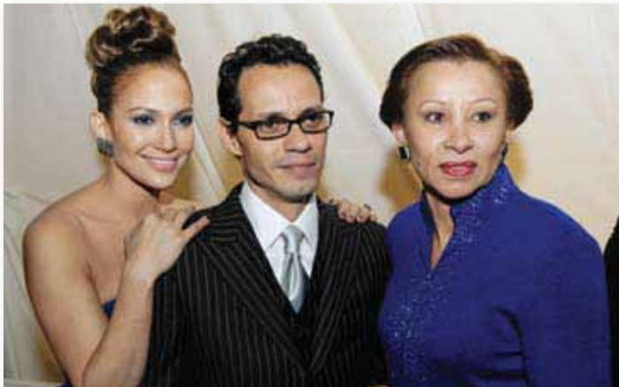
(L-R) Celebrities Jennifer Lopez, Marc Anthony along with Congressional Hispanic Caucus Chair Rep. Nydia Velasquez (D-NY).

Actress-singer Jennifer Lopez, her husband, singer Marc Anthony, "That '70s Show" star Wilmer Valderrama, "Ugly Betty" star Tony Plana and comedian George Lopez were among the Latino celebrities who joined the black-tie event in anticipation of Barack Obama's Jan.