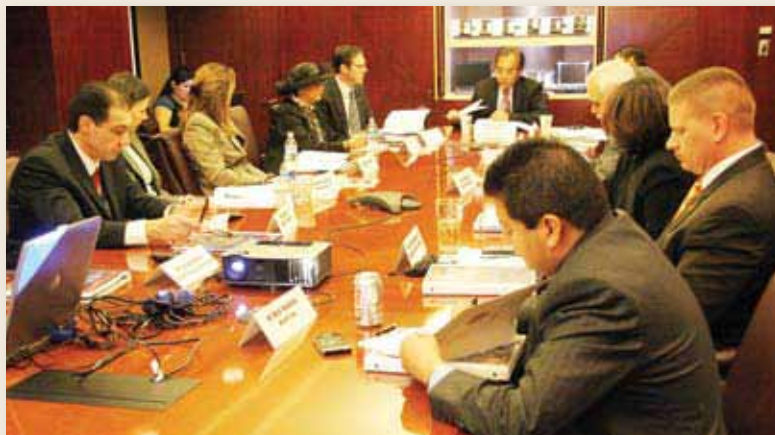
LULAC National meets with Corporate Alliance Board Members at Verizon offices in Washington, D.C.