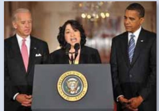
Sotomayor with Vice President Biden and President Obama at the White House.

by President Obama. Sotomayor has been a federal judge for 17 years. Obama nominated her in May to take the place of Justice David Souter after Souter announced his retirement. The Senate confirmed Sotomayor’s nomination by a vote of 68-31.