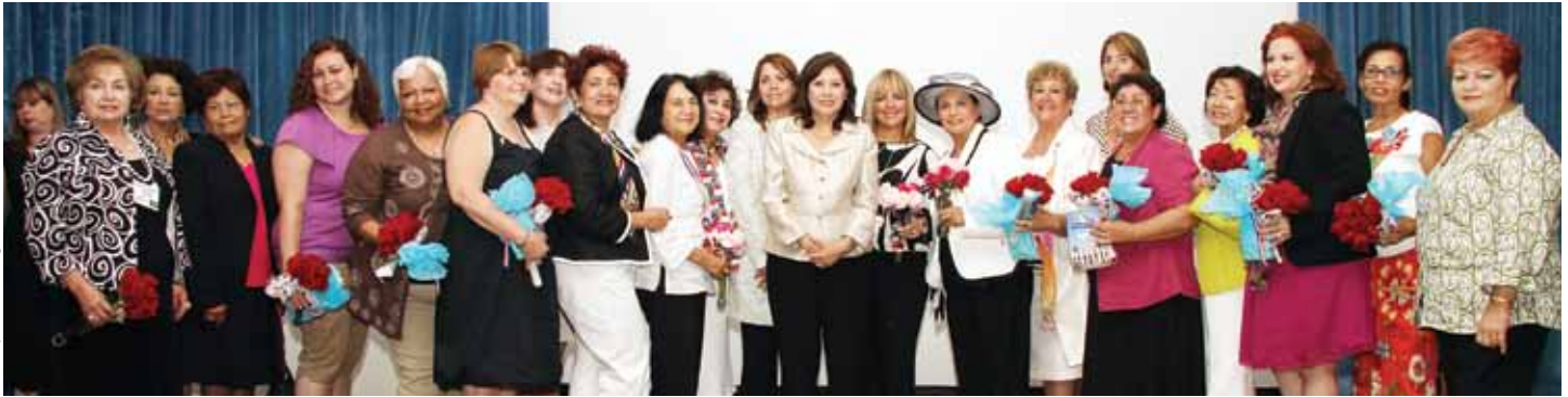
2009 Women Commissioners, High Tea Hall of Fame Award Recipients, First Lady of Puerto Rico and Secretary of Labor Hilda Solis.

Secretary of Labor Hilda Solis paid tribute to Latinas at the 6th Annual Women's Hall of Fame Pinning Ceremony and High Tea reception during LULAC's 80th Convention in San Juan, Puerto Rico. The event recognized the advances by Latinas.