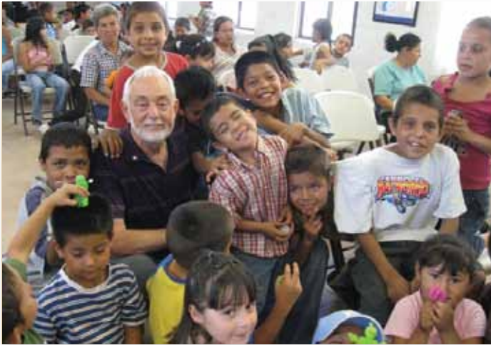
Arizona Tree of Life volunteers cheer the orphans in Imuris Sonora Mexico

LULAC Mexico #1 has had up to 90 associate members. There are media reports that there are recurring abandoned children deported by the “Migra” in Mexican towns along Arizona border. The council main thrust has been to enlist LULAC Arizona and other NGO’s to help children in the “albergues” or shelters. Recently, there are an estimated 40,000 abandoned children in the US/Mexico border region because of the deported. These associates are in their 4th year of operation.