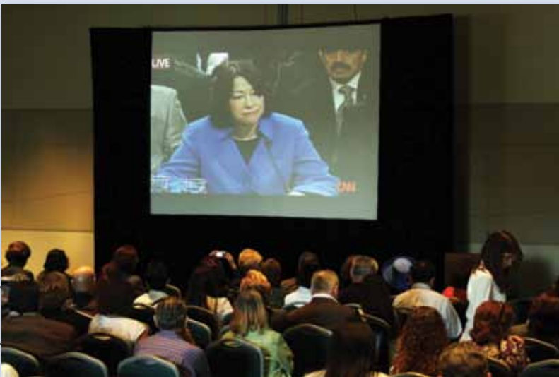
Hispanics from around the country watched confirmation hearings via television.

Chief Justice Roberts said Sotomayor could “begin work as associate justice without delay.”