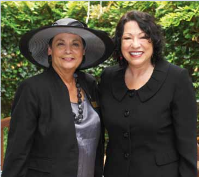
National LULAC President Rosa Rosales and Supreme Court Justice Sonia Sotomayor.