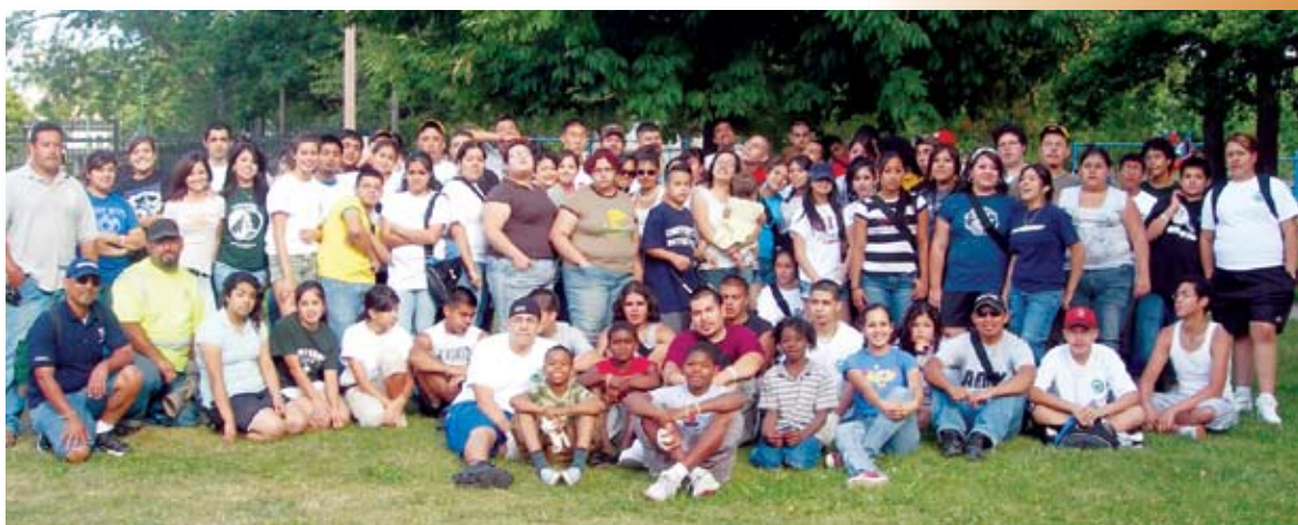
Over 100 LULAC Youth conducted Community Service at Lindblom Park in Chicago, Illinois.