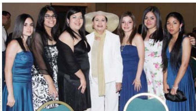
LULAC National President Rosa Rosales with LULAC Youth Ladies.

One-year subscription price is $24. Single copies are $4.50. LULAC members receive a complimentary subscription. The publication encourages LULAC members to submit articles and photos for inclusion in future issues. Once submitted, articles are property of the LULAC News and may be subject to editing.