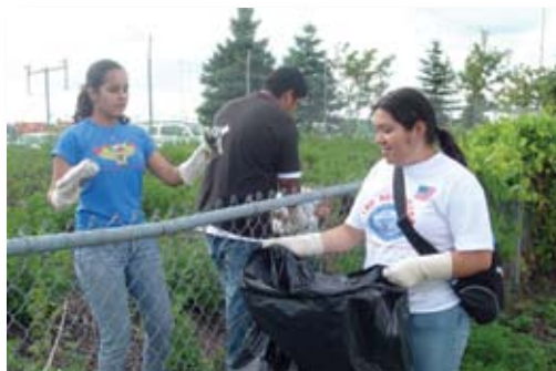
LULAC Youth members picking up trash at Lindblom park.