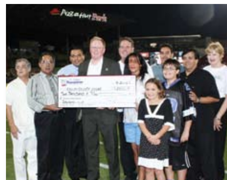
F.C. Dallas check presentation to LULAC Council in Collin County, Texas on September 2007.