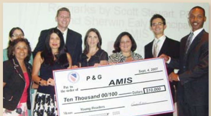
LULAC Cincinnati and P&G presenting $10,000 check to AMIS (Academy of Multilingual Immersion Studies) for Young Readers Program.