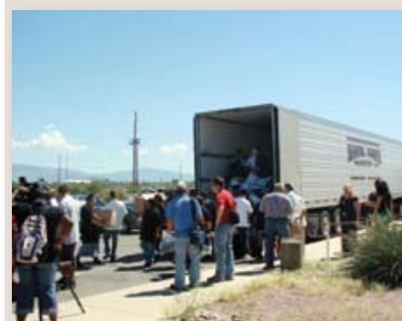
LULAC, World Care, PPEP, Inc., and Mexico Associate LULAC Council #1 teamed up again to help Sonora victims of Hurricane Henriette, 12 tons of emergency supplies were delivered to rural Sonoran communities.