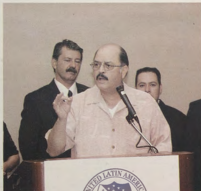
LULAC National President Hector Flores addressed attendees at the Annual Women's Conference this past April.

One-year subscription price is $24. Single copies are $4.50. LULAC members receive a complimentary subscription. The publication encourages LULAC members to submit articles and photos for inclusion in future issues. Once submitted, articles are property of the LULAC News and may be subject to editing.