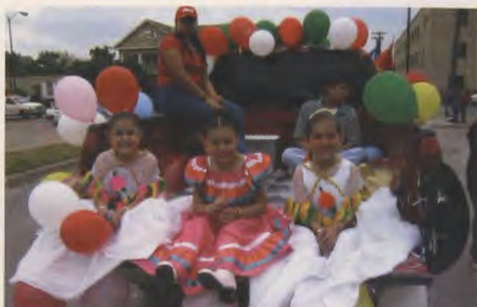
Young ladies celebrate Cinco de Mayo in Oak Cliff, Dallas, Texas. LULAC participated in this event.