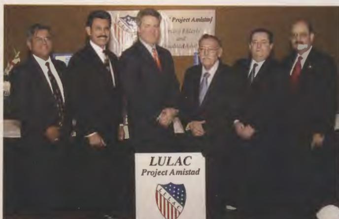
Celebrating and honoring Project Amistad in El Paso, Texas.