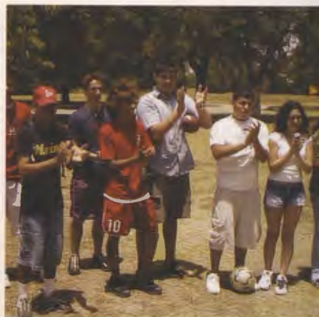
LULAC Youth enjoy a soccer game during the District 3 Youth Picnic in Texas.