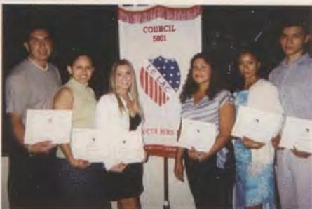
The above students are on their way to college thanks to scholarships awarded by Council 5001 in South Bend, Indiana.