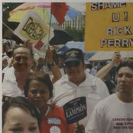
LULAC members during the anti-redistricting rally in Austin, Texas.

We are now in a third special session, and a map that completely dilutes minority representation while adding at least four additional Republican seats has passed. So where does this leave our voting rights? Well, the court will have to decide. We must not be discouraged; instead let's learn from what has happened in Texas and let it be an inspiration for all LULAC members and anyone else who champions American ideals to become more involved in the political process at the local, state, and national level. Let what happened in Texas be a wake up call, we cannot allow a few to make decisions for all of us. The welfare of this nation depends on using our voting power wisely, and holding elected and appointed officials accountable for their action and inactions.