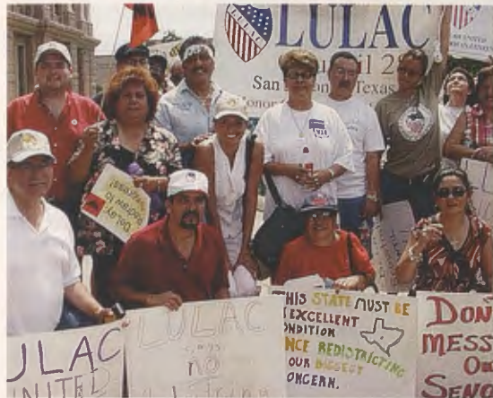
LULAC members during the anti-redistricting rally in Austin, Texas.