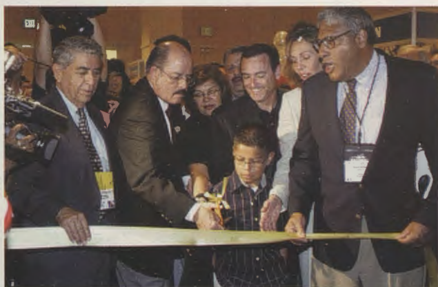
Above Photo: The ribbon cutting ceremony during the LULAC National Convention in Orlando, Florida.