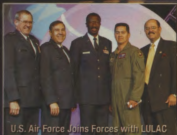
U.S. Air Force Joins Forces with LULAC