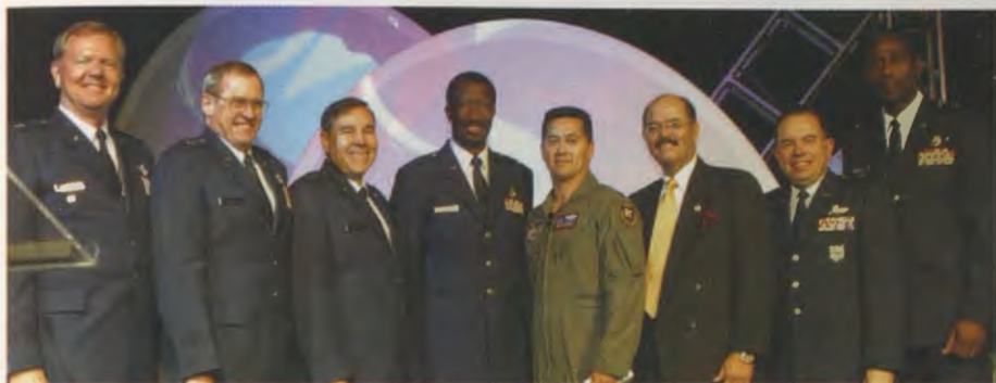
LULAC National President Hector Flores with U.S. Air Force representatives during the LULAC National Convention in Orlando, Florida this past June.

It is also the largest and oldest Hispanic association and offers the best chance of recruiting more Hispanics, which is something that is sorely needed due to the low numbers of Hispanics in the Air Force. During that time we not only started a LULAC chapter but we were also founding members of the Defense Advisory Council for Hispanic Issues (DACHI). DACHI was formed to assist the Department of Defense in increasing its total Hispanic representation and in securing an equitable share of leadership positions for Hispanics.