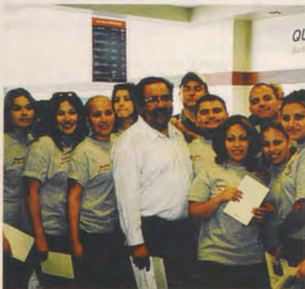
LULAC Council 5002 with LULAC member U.S. Representative Raul Grijalva (D-AZ) at the Cesar Chavez Stamp Unveiling in San Luis, Arizona.