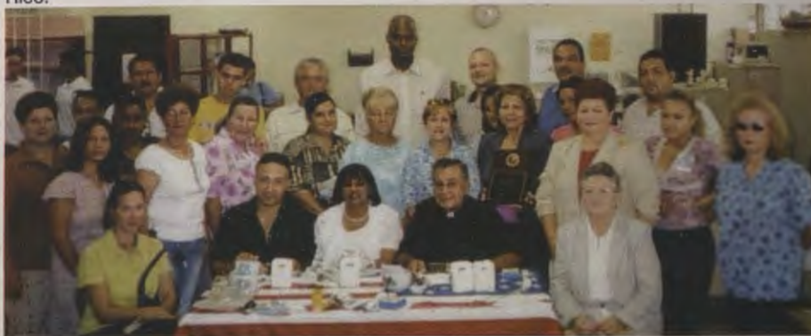
The below photo was taken during the "Searching for Peace" conference in Puerto Rico.