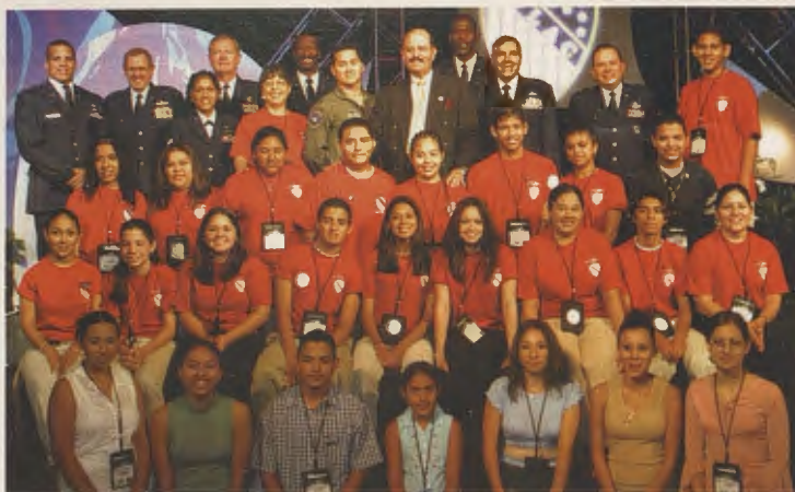
LULAC Youth and Young Adults with Air Force representatives at the Air Force Breakfast during the LULAC National Convention in Orlando, Florida this year.