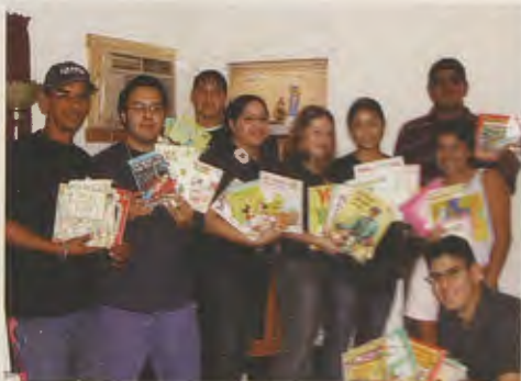
LULAC Youth from the Ft. Worth District collect books for the literacy project in Texas.