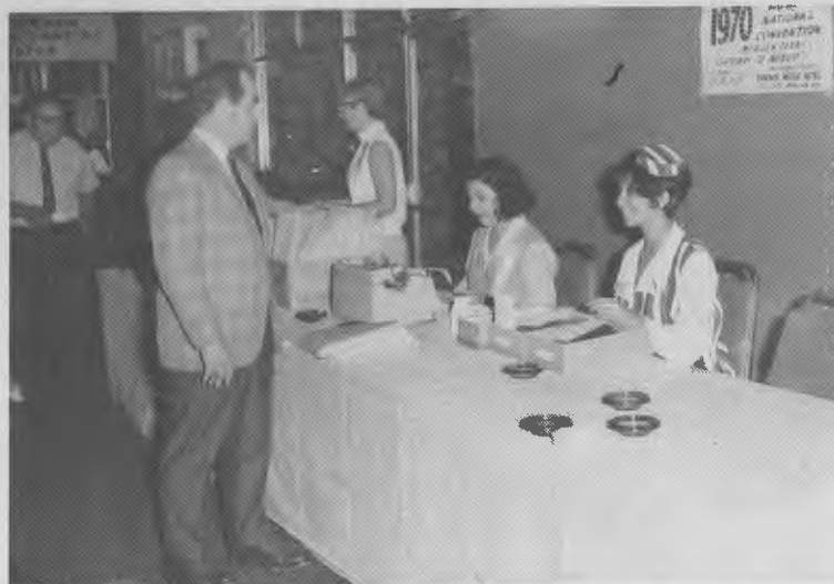
FIRST TO REGISTER AT NATIONAL CONVENTION

WHEREAS, our late President John F. Kennedy appointed the Honorable Raymond Tellez, of El Paso, Texas, U. S. Ambassador to the Republic of Costa Rica; and our former President Lyndon B. Johnson appointed the Honorable Raul H. Castro, U.S. Ambassador to the Republic of El Salvador and later promoted him