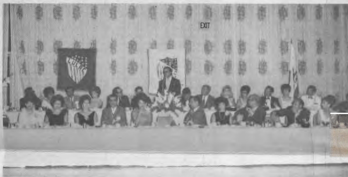
Gilbert Roland addressing convention Saturday night, June 28, 1969.