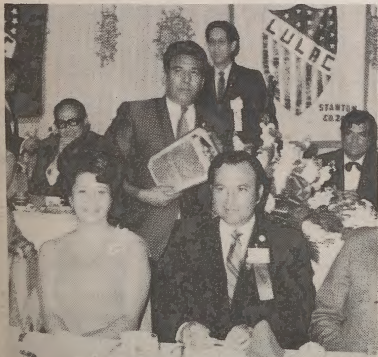
LULAC MAN OF THE YEAR