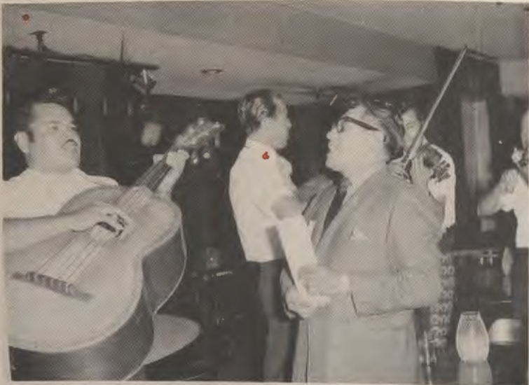
The Singing President And His Mariaches.