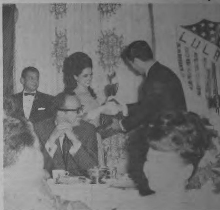
RECEIVING LULAC COUNCIL OF YEAR AWARD