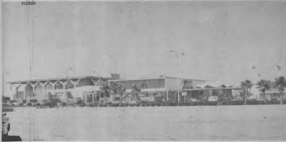
Edgewater Hyatt House, Long Beach, Cal. Where Lulac National Convention was held. Next years convention will be in McAllen, Texas.