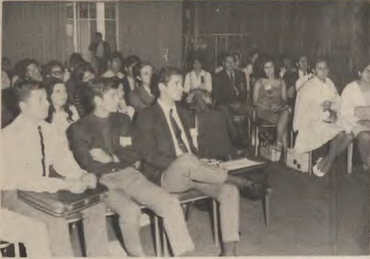
Members of Junior Lulac at one of their meetings.