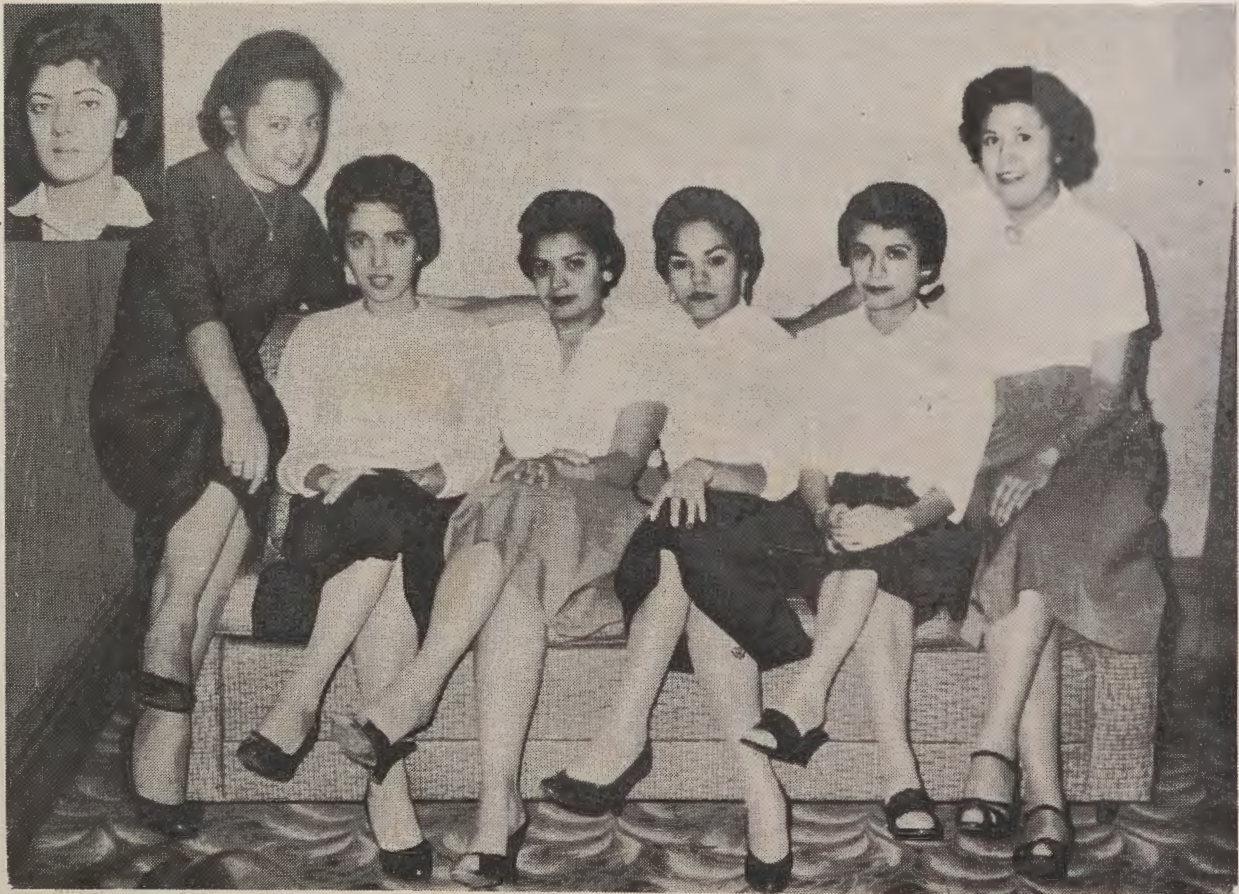
Chicago, Illinois Ladies Delegates and Alternates to the National Convention