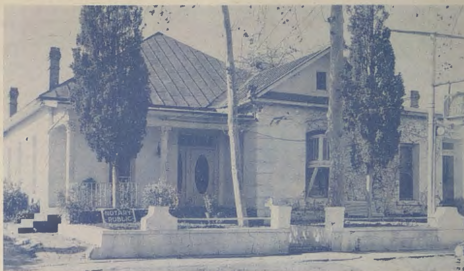
The Joe Ortiz Funeral Home