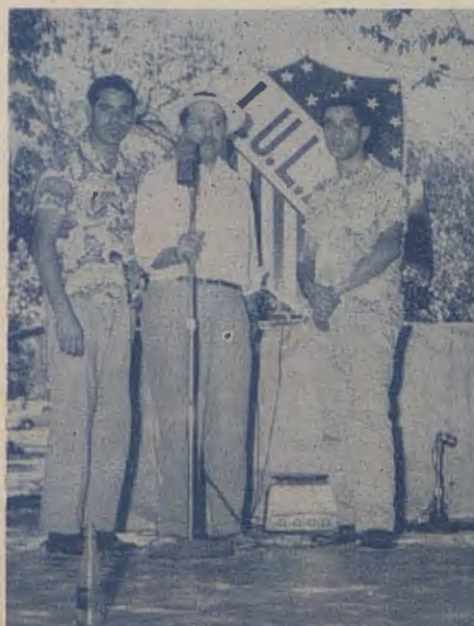
DEMING COUNCIL BARBECUE:

That means there still must be raised about $1,200 before debts incurred during construction of the ward can be written off.