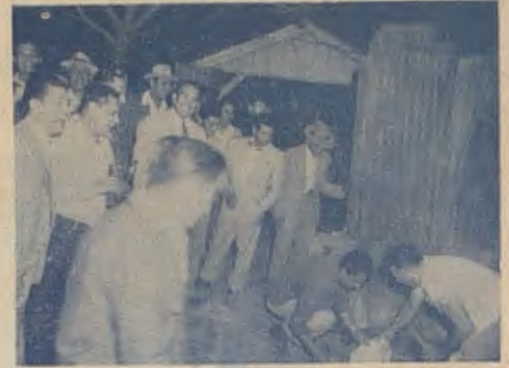
Delicious Barbecue being served to our Houston boys and their friends